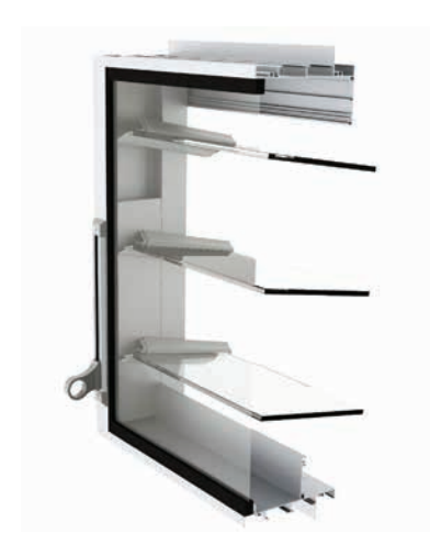
ios® Window System with inside slide screen handle