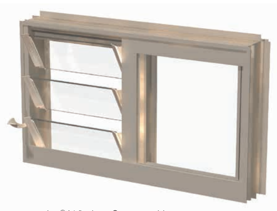
ios® Window System with picture window

The ios Window System is an innovative design that provides inside or outside screening options to