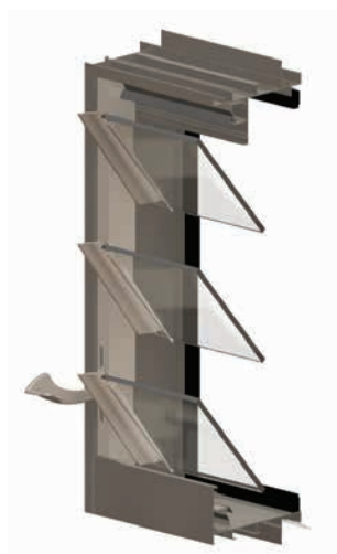
ios® Window System with outside screen

*Note Altair Louvers can also be fitted into vinyl, wood and other aluminum surround frames if required. Contact your local Breezway Preferred Dealer for more information.