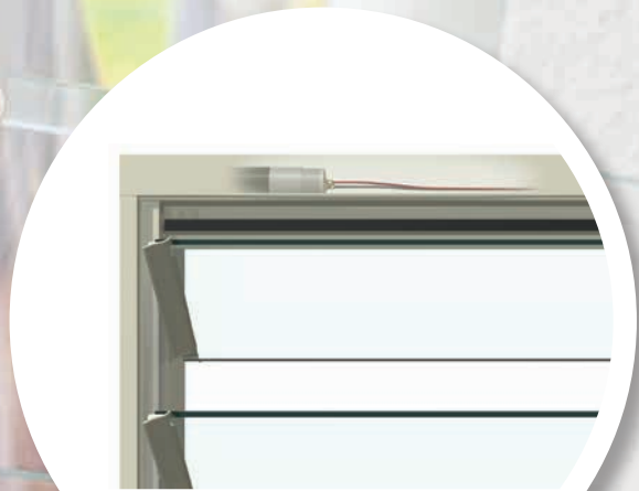
Motor is concealed within the head of the window frame.